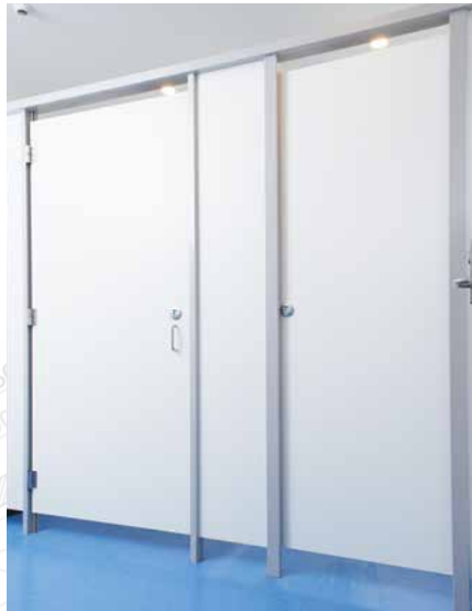
Hamilton Boys High