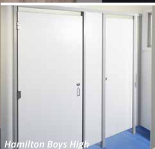
Hamilton Boys High