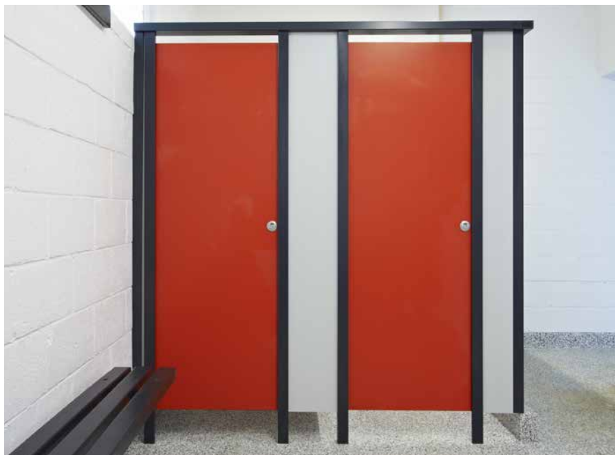
Cambridge Athletic Club