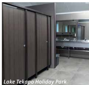
Lake Tekapo Holiday Park