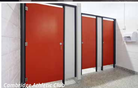
Cambridge Athletic Club