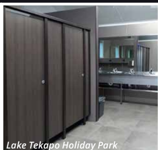
Lake Tekapo Holiday Park