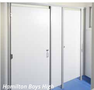
Hamilton Boys High