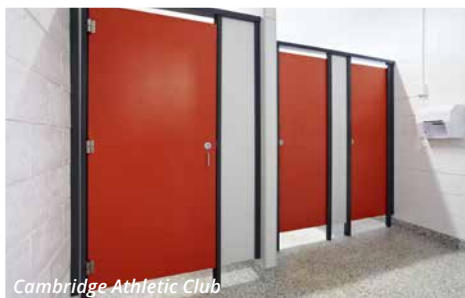
Cambridge Athletic Club