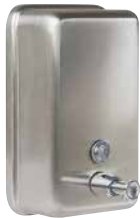
Vertical Soap Dispenser ML605AS-N