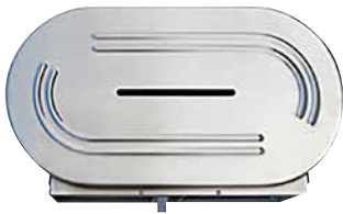
Double Jumbo Toilet Roll Dispenser ML841-DBL