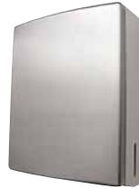
Ellipse Paper Towel Dispenser ANMB-725AR