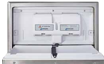
Recessed Horizontal Baby Change Station ML-8200REC