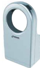
EcoMo Auto High Speed Hand Dryer ML-ECOMOROUND-SIL