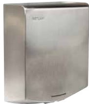
Eclipse Auto Operation Hand Dryer ML-ECLIPSE05-SS