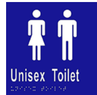
Unisex Sign ML16211-SS