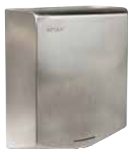
Eclipse Auto Operation Hand Dryer ML-ECLIPSE05-SS