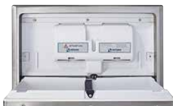
Recessed Horizontal Baby Change Station ML-8200REC