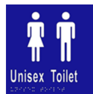
Unisex Sign ML16211-SS