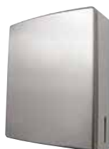
Ellipse Paper Towel Dispenser ANMB-725AR