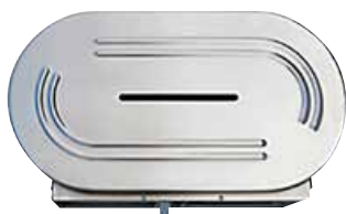
Double Jumbo Toilet Roll Dispenser ML841-DBL