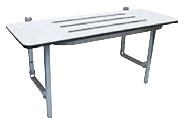
Compact Laminate Folding Shower Seat ML995-CL