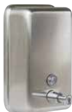
Vertical Soap Dispenser ML605AS-N