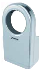
EcoMo Auto High Speed Hand Dryer ML-ECOMOROUND-SIL