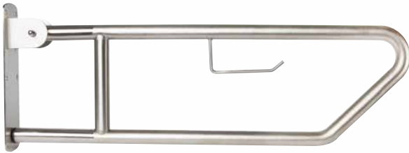
SMR55P-TPH - Drop Down Peened Grab Rail with toilet roll holder