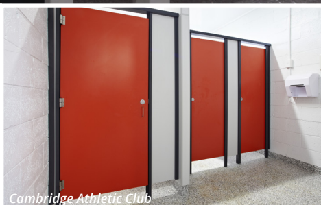
Cambridge Athletic Club