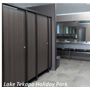
Lake Tekapo Holiday Park