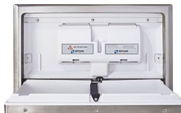
Recessed Horizontal Baby Change Station ML-8200REC