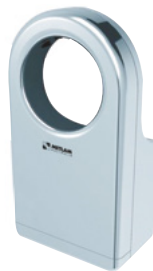
EcoMo Auto High Speed Hand Dryer ML-ECOMOROUND-SIL