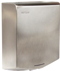
Eclipse Auto Operation Hand Dryer ML-ECLIPSE05-SS