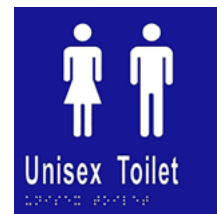
Unisex Sign ML16211-SS