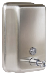
Vertical Soap Dispenser ML605AS-N