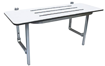
Compact Laminate Folding Shower Seat ML995-CL