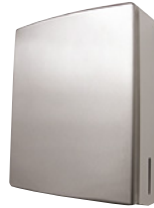
Ellipse Paper Towel Dispenser ANMB-725AR