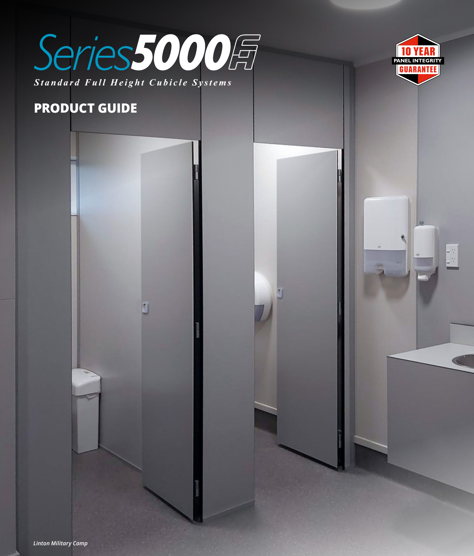
Linton Military Camp