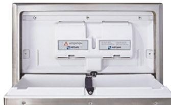
Recessed Horizontal Baby Change Station ML-8200REC