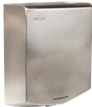
Eclipse Auto Operation Hand Dryer ML-ECLIPSE05-SS