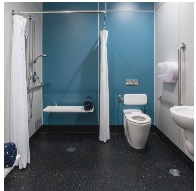
Ideal for both shower and/or W/C