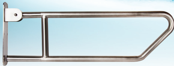
SMR55P- Drop Down Peened Grab Rail