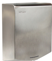
Eclipse Auto Operation Hand Dryer ML-ECLIPSE05-SS