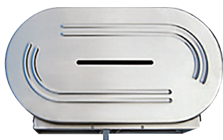
Double Jumbo Toilet Roll Dispenser ML841-DBL