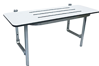
Compact Laminate Folding Shower Seat ML995-CL