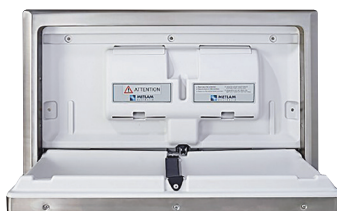
Recessed Horizontal Baby Change Station ML-8200REC