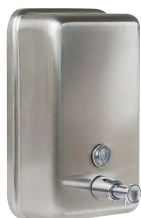
Vertical Soap Dispenser ML605AS-N