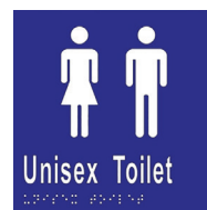
Unisex Sign ML16211-SS