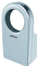
EcoMo Auto High Speed Hand Dryer ML-ECOMOROUND-SIL