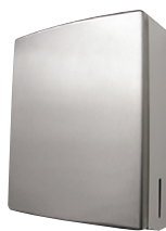
Ellipse Paper Towel Dispenser ANMB-725AR