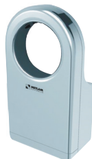
EcoMo Auto High Speed Hand Dryer ML-ECOMOROUND-SIL