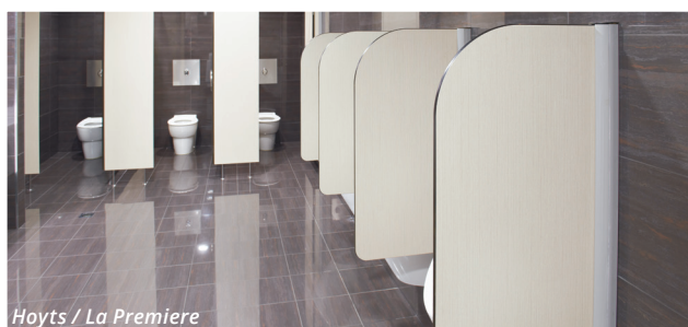
Hoyts / La Premiere