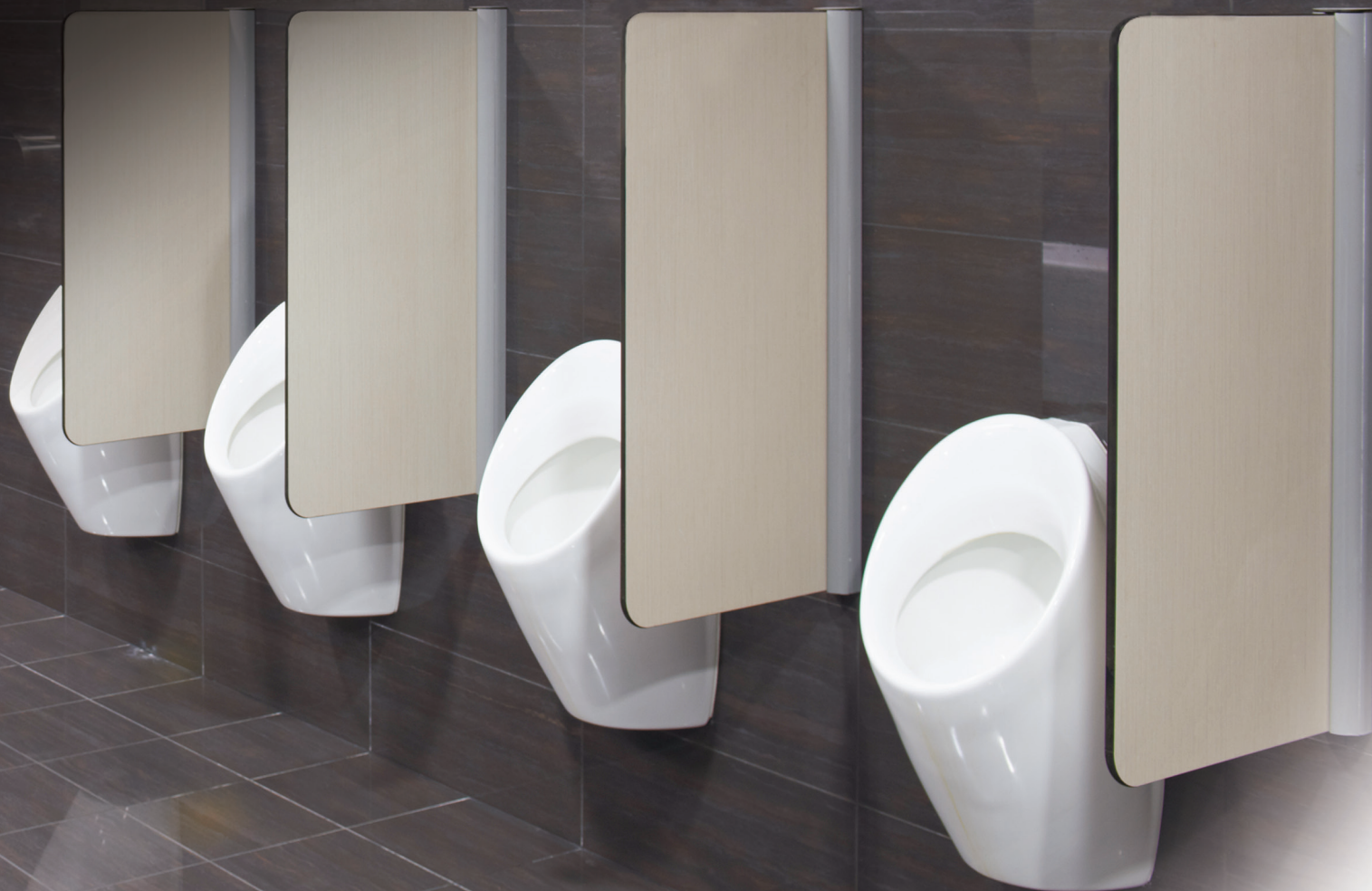
Hoyts / La Premiere