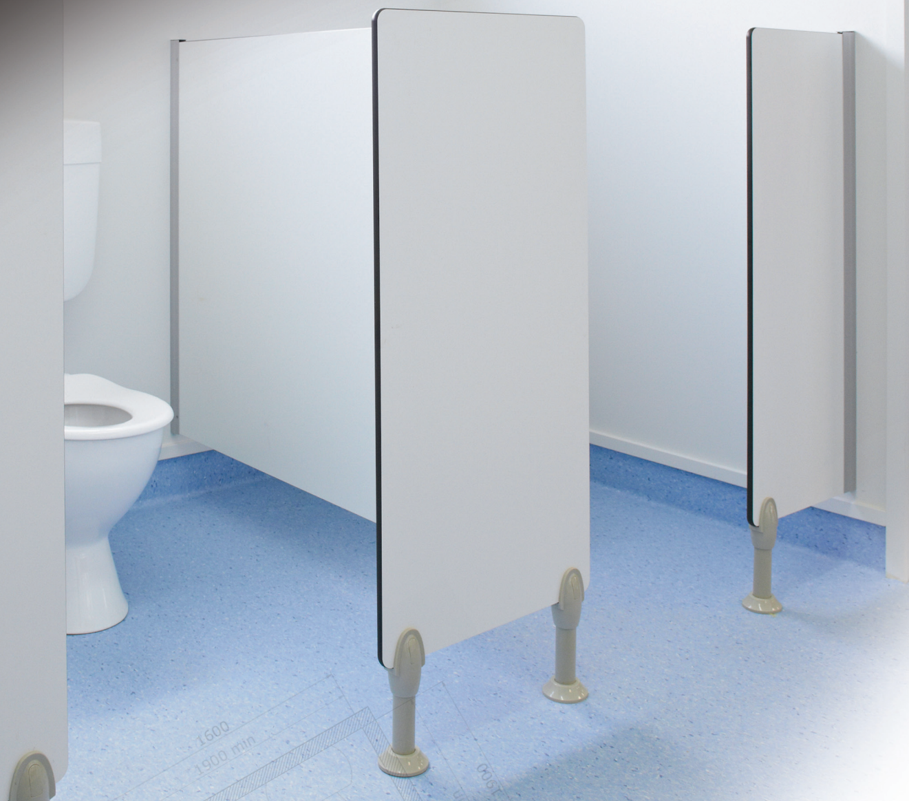
The Children's Corner