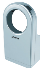
EcoMo Auto High Speed Hand Dryer ML-ECOMOROUND-SIL