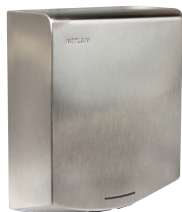
Eclipse Auto Operation Hand Dryer ML-ECLIPSE05-SS