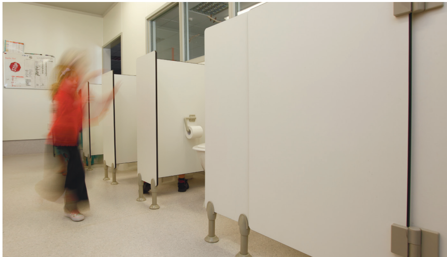
The Park Early Education Waikato