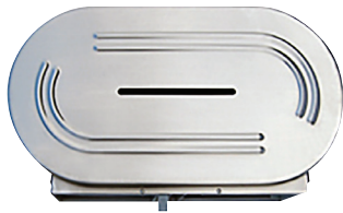
Double Jumbo Toilet Roll Dispenser ML841-DBL