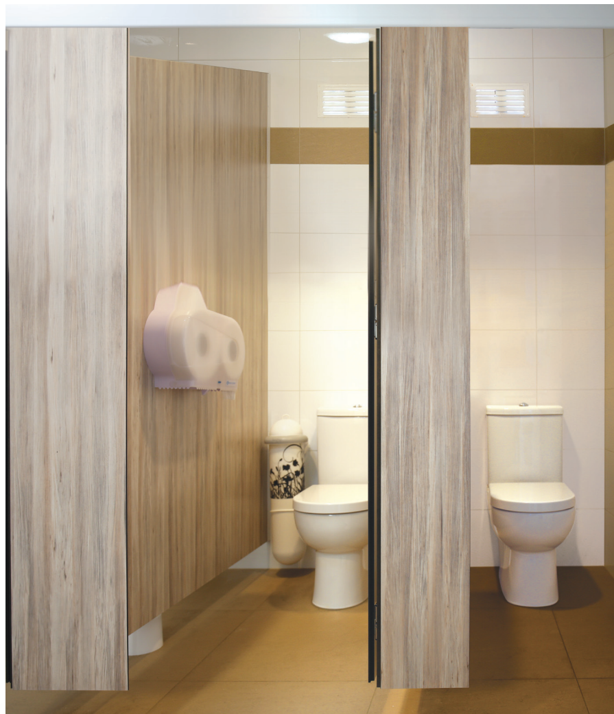
Papamoa Beach Resort