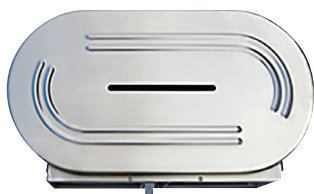
Double Jumbo Toilet Roll Dispenser ML841-DBL