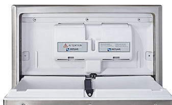
Recessed Horizontal Baby Change Station ML-8200REC