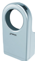
EcoMo Auto High Speed Hand Dryer ML-ECOMOROUND-SIL