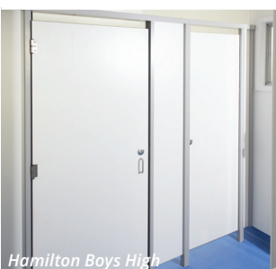
Hamilton Boys High