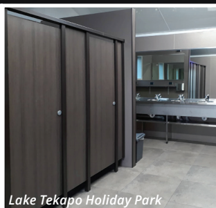
Lake Tekapo Holiday Park