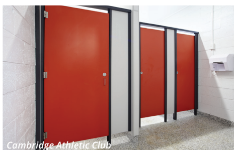
Cambridge Athletic Club