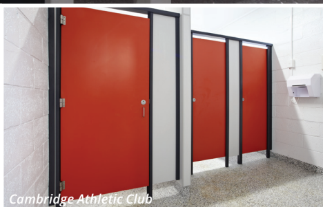
Cambridge Athletic Club