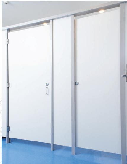
Hamilton Boys High