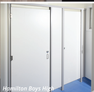
Hamilton Boys High