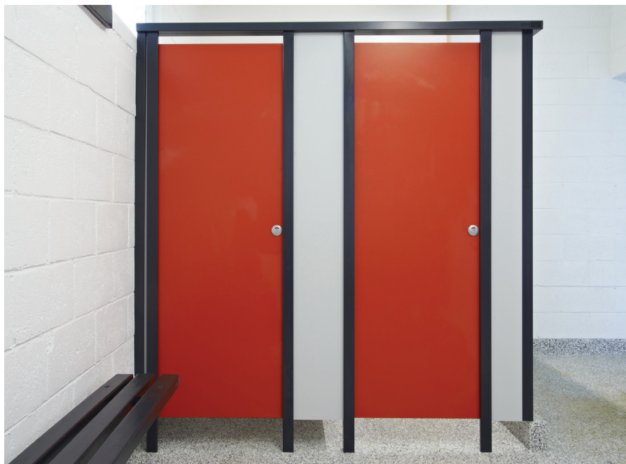
Cambridge Athletic Club