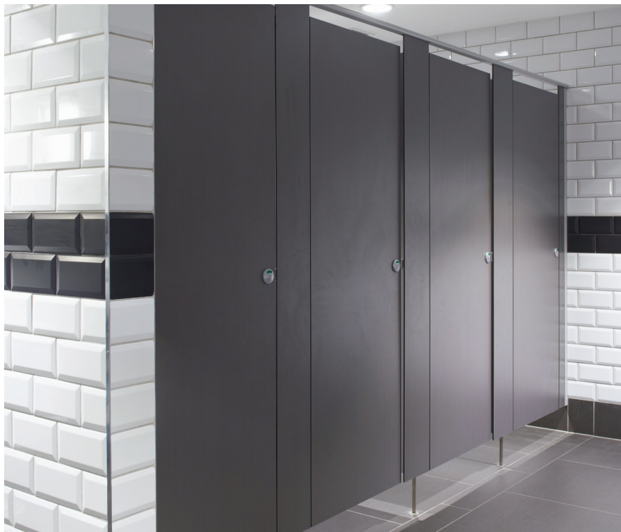
Metro / Hoyts