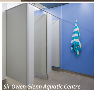
Sir Owen Glenn Aquatic Centre