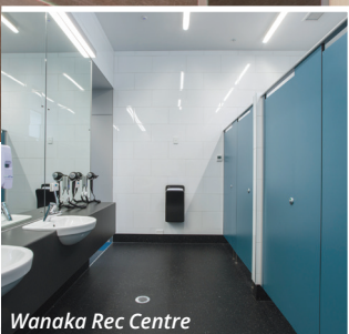
Wanaka Rec Centre