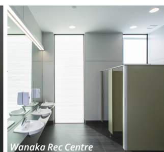
Wanaka Rec Centre