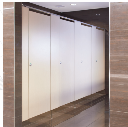
Hoyts / La Premiere