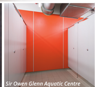
Sir Owen Glenn Aquatic Centre