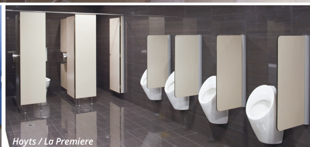
Hoyts / La Premiere