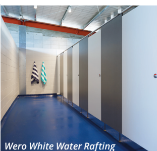
Wero White Water Rafting