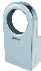
EcoMo Auto High Speed Hand Dryer ML-ECOMOROUND-SIL