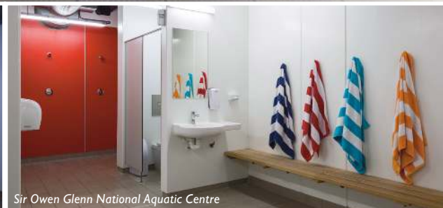
Sir Owen Glenn National Aquatic Centre