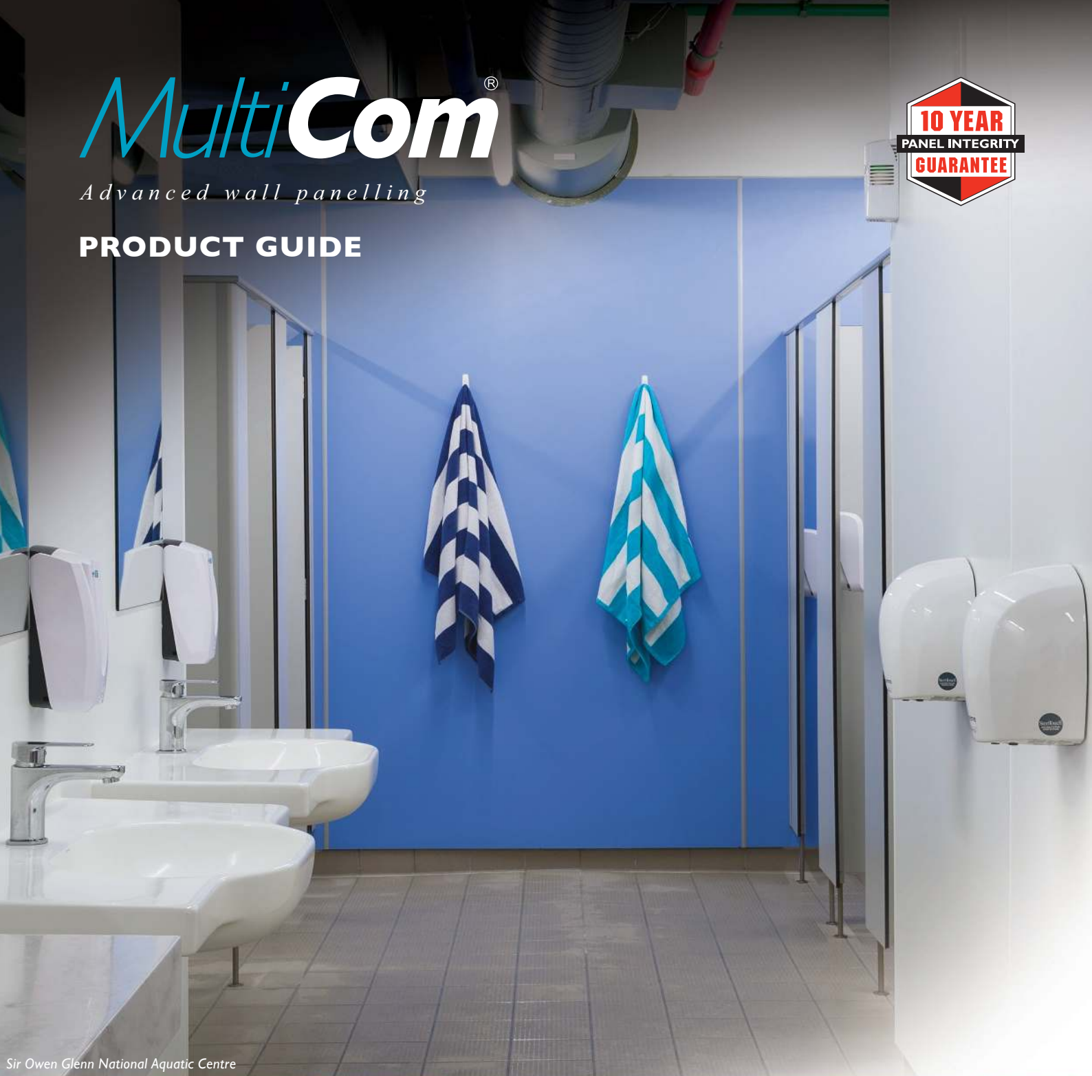
Sir Owen Glenn National Aquatic Centre