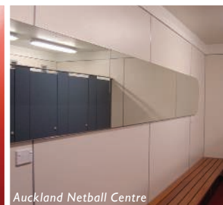
Auckland Netball Centre