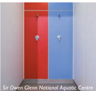
Sir Owen Glenn National Aquatic Centre