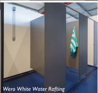
Wero White Water Rafting