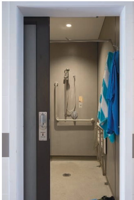
Sandspit Holiday Park