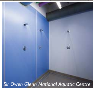
Sir Owen Glenn National Aquatic Centre