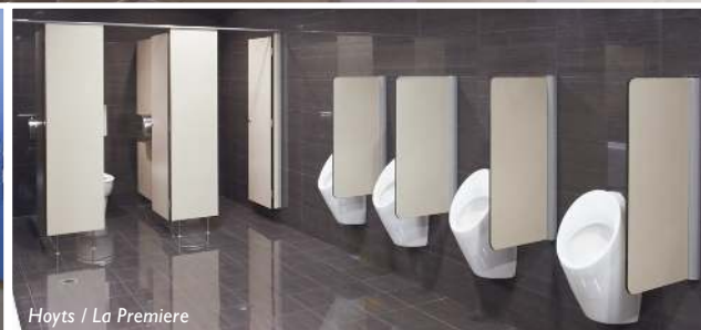
Hoyts / La Premiere