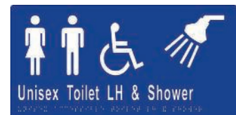
SIGN ACCESSIBLE WC ML16297 SS or LV06/12 (LH), ML16298 SS or LV06/12 (RH)