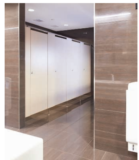
Hoyts / La Premiere