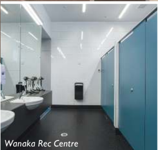
Wanaka Rec Centre