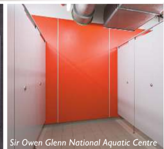
Sir Owen Glenn National Aquatic Centre