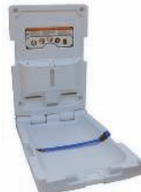
BABY CHANGE TABLE ML9100EV/IEH, ML8200 REC OR SM