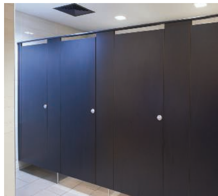
Novotel Auckland Airport