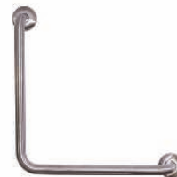
GRAB RAIL MLR112. MLR112 ONLY (pair are required)