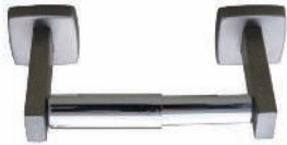
TOILET ROLL HOLDER ML255/256, ML820/825, ML267, ML835, ML837/838, ML4135/4135-2