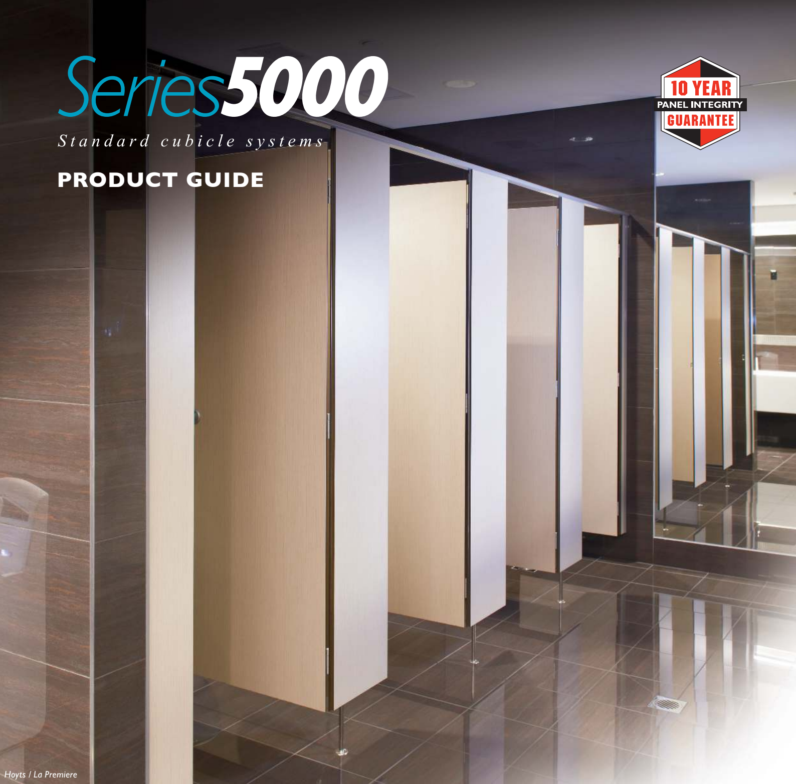
Hoyts / La Premiere