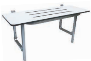
COMPACT LAMINATE FOLDING SHOWER SEAT ML995CL