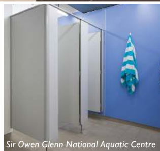
Sir Owen Glenn National Aquatic Centre