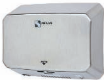
HAND DRYER ECOMO, ECOSLENDER, ECOFAST, ECLIPSE, ML73nI