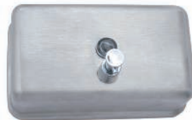
SOAP DISPENSER ML600AS/BS, ML603AS/BS, ML605AS/BS, ML681F/SSF, ML950DA/SS