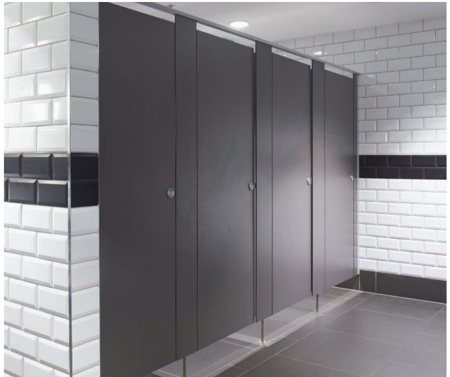
Metro / Hoyts