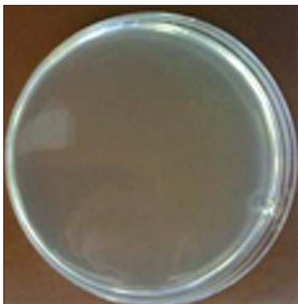
Resco Antibac Panel