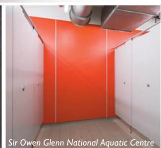
Sir Owen Glenn National Aquatic Centre