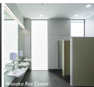
Wanaka Rec Centre

Series5000 Series7000 MultiCom MultiCube KindyCube StormCube BioLab ChemLab