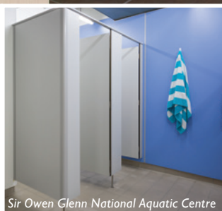
Sir Owen Glenn National Aquatic Centre