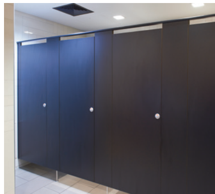
Novotel Auckland Airport