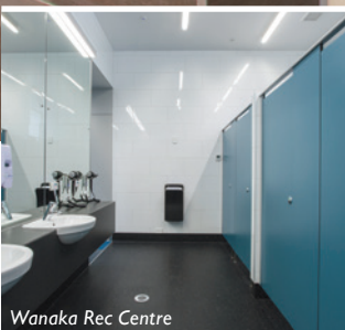
Wanaka Rec Centre