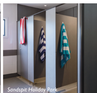
Sandspit Holiday Park