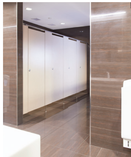
Hoyts / La Premiere