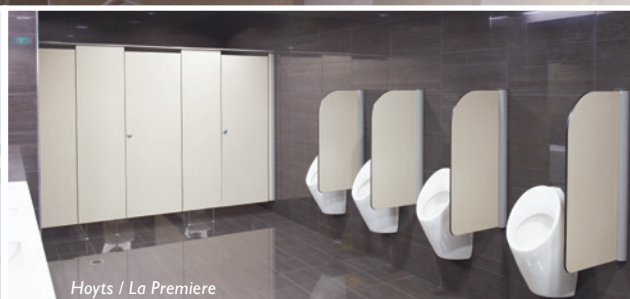
Hoyts / La Premiere