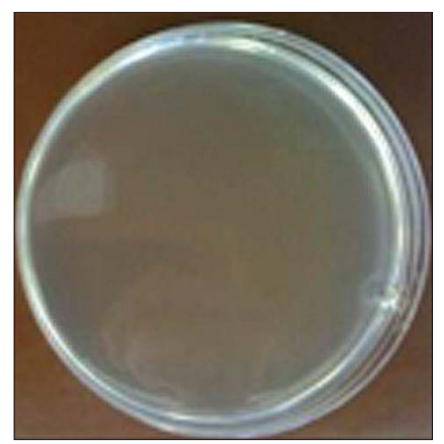
Resco Antibac Panel