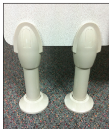
Height adjustable pedestals