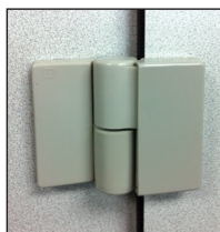
Nylon coated hinges and corner brackets