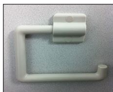
Matching toilet roll holders